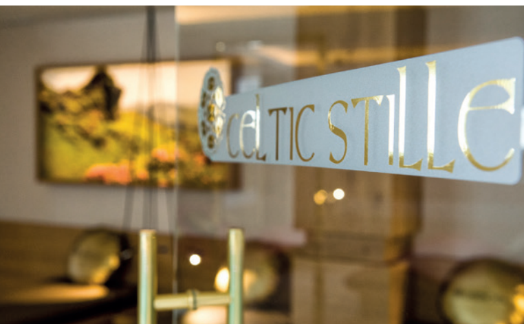
Österreichischer Hof, Alpentherme Gastein